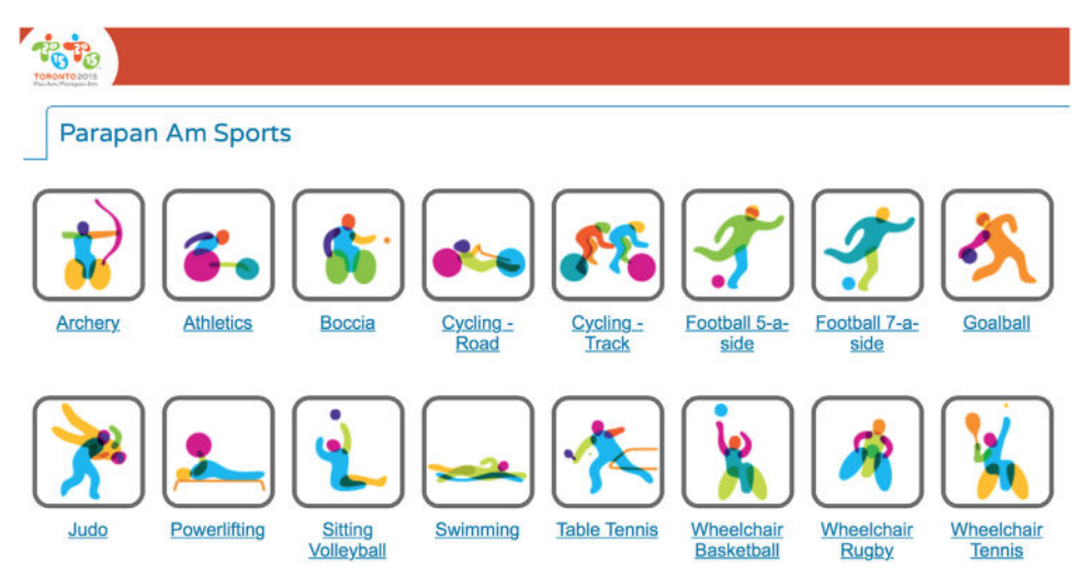
Fig. 2-Sporting events of the Parapan Am Games 2015.

Am Games were smaller in terms of number of athletes and events (Figs. 3 and 4). The Athletes' Village was established in the West Don Lands along Front Street between Bayview Avenue and Cherry Street.<sup>2</sup> The facility had the capacity to accommodate 10 000 athletes and officials. The competing athletes from 41 countries are broken down as shown in Table 1.