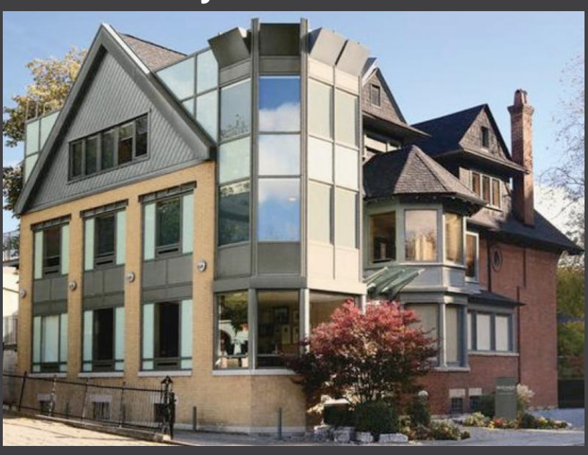
Spring Newsletter 2016